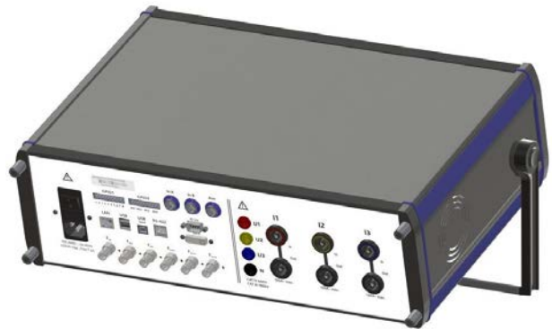
Rear panel of the Reference Standard RS 3330